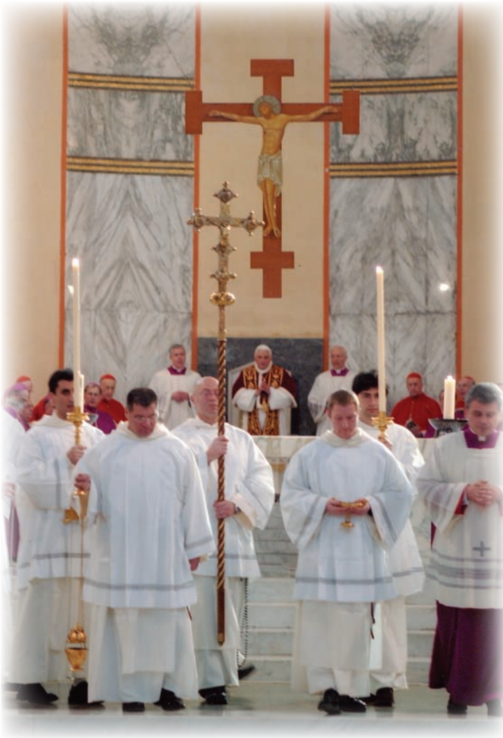
Above, Pope Benedict XVI begins the liturgy of Ash Wednesday at Sant' Anselmo.