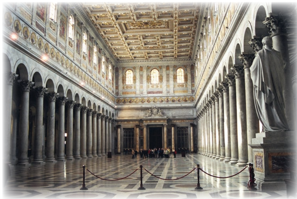
Saint Paul Outside the Walls, which was the first international Benedictine school in Rome.

Pope Leo's choice of a patron saint for this new international college was itself symbolic of the whole