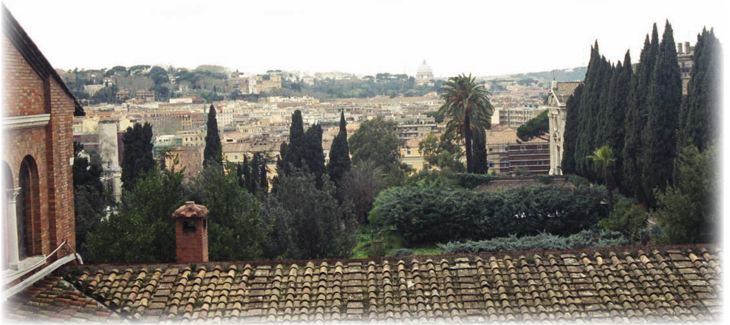
Above, view of the Vatican from a rooftop balcony at Sant' Anselmo, the International Benedictine University of Rome. Below, at left, statue of Saint Benedict at Montecassino, Italy. Below, right, statue of Saint Anselm at Sant' Anselmo.