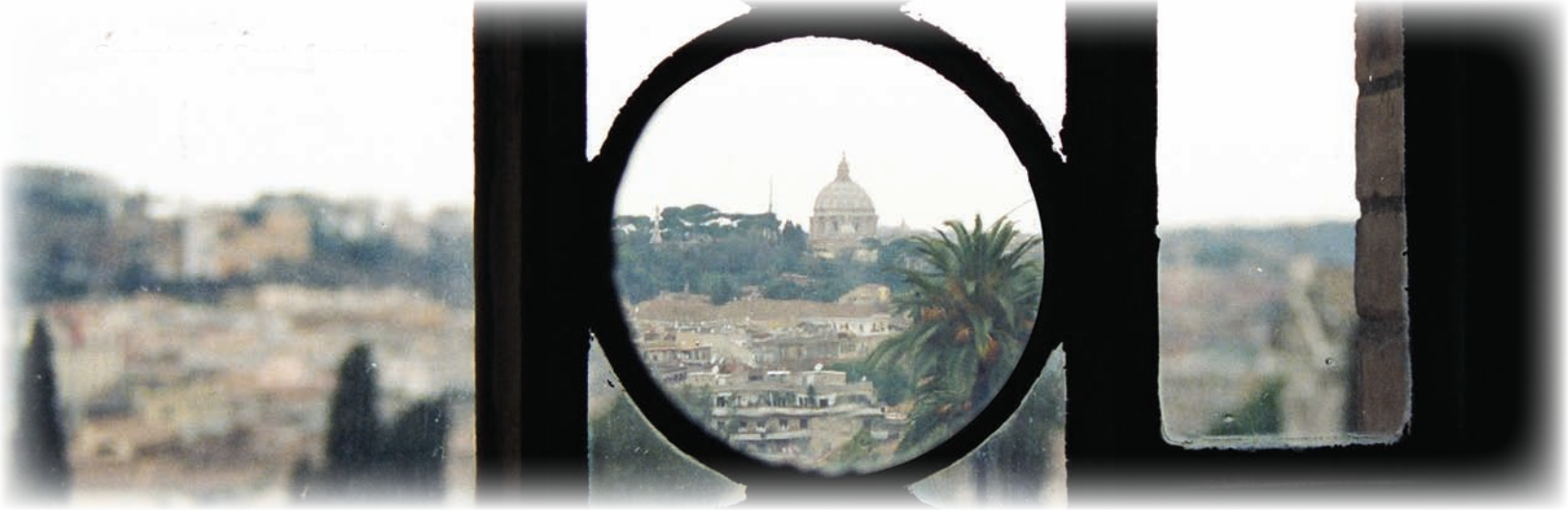
View of the Vatican from the campus of Sant' Anselmo.