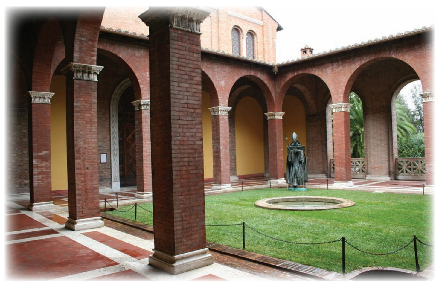
Courtyard with the statue of Sant' Anselmo.