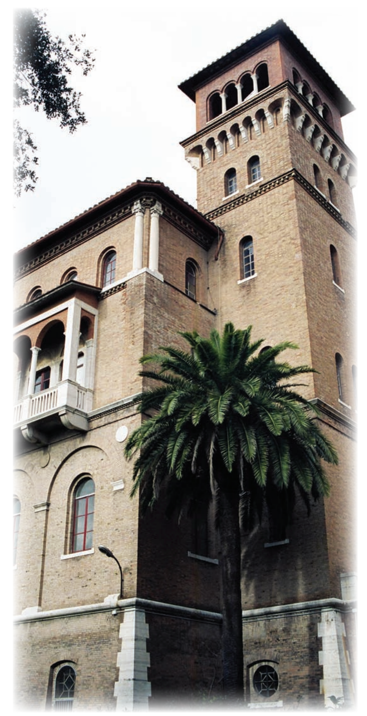
Tower on the campus of Sant' Anselmo on the Aventine Hill in Rome.

Your gift, no matter how you choose to donate, does make a difference both for the charity and for you, the donor. All gifts are important and are received in the spirit of God's command to love Him and love one another. God will not forget or be outdone in your generosity.