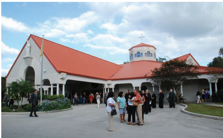
Saint Clement Catholic Church, Plant City, Fla., hosted Abbot Primate Notker Wolf, O.S.B.