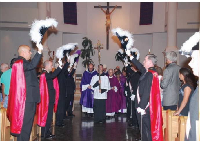
The Knights of Columbus provide an honor guard during the recessional.