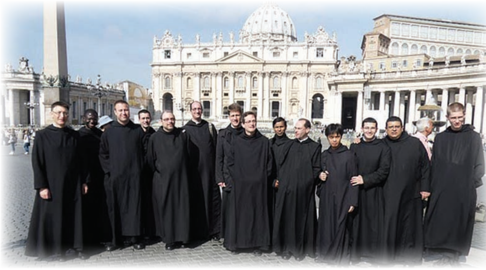
Sant' Anselmo students who participated in the funeral of Cardinal Mayer.

“At this moment, my thoughts cannot but go to the Shrine of the Mother of Graces of Altötting. Spiritually turned to that place of pilgrimage, we entrust to the Holy Virgin our prayer of suffrage for mourned Cardinal Mayer. He was born near that Shrine, conformed his life to Christ according to the Benedictine Rule , and died in the shadow of this Vatican Basilica. May the Virgin, Saint Peter and Saint Benedict accompany this faithful disciple of the Lord to his Kingdom of light and peace. Amen.”